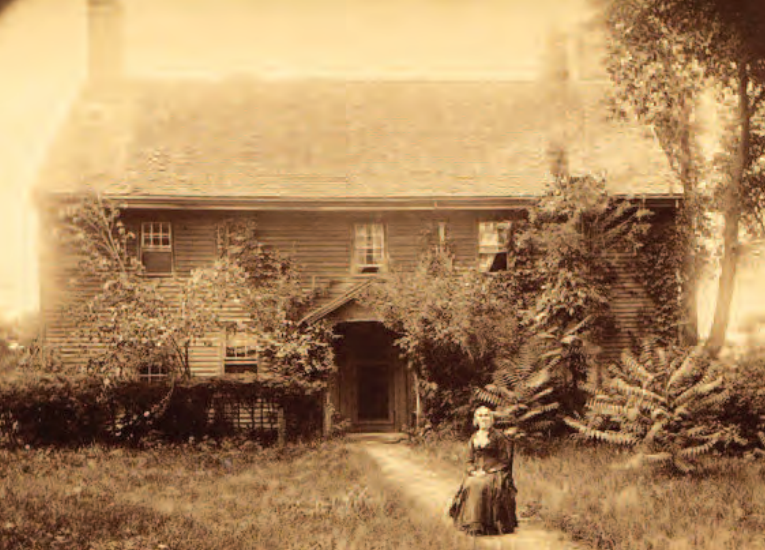
ON THE COVER: The John Ward House. ABOVE: Coffin House, 1678.