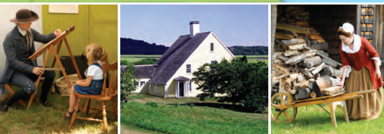
LEFT: Photo by Rex Passion. CENTER: R. Heath / Courtesy of The Trustees of Reservations. RIGHT: Photo by Rex Passion.

Enjoy free programming at all sites on June 4 th !